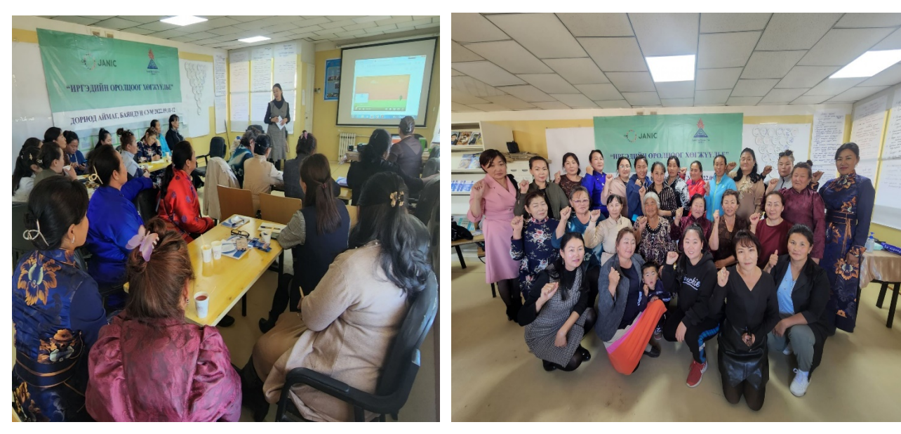
Training workshop in Bayandun soum of Dormnod province, September 13-15, 2022