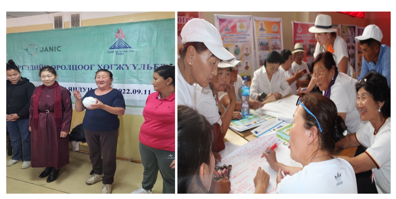
Training workshop in Choibalsan city of Dornod province, September 11-12, 2022